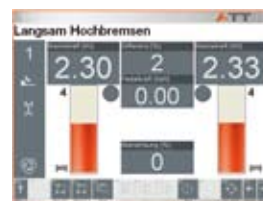
During the brake test, the brake force, brake force difference and deceleration, as well as the optional pedal force are permanently displayed.