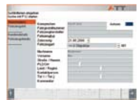
For entering, saving and managing customer- and vehicle data on the central database.