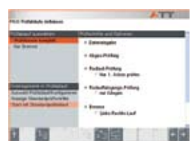
For customer specific definition and default setting of test sequences.