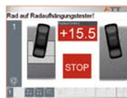
Easy understandable presentation for the directional stability of the vehicle.