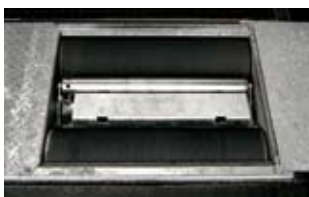
lifting- / lowering device

The vehicle can easily exit the rollers without wasting time due to the worm gear transmission which blocks the roller after the testing has finished. Moreover the lifting- / lowering device does away with conventional cover plates to enable a smooth crossing of the brake tester in any direction. Utilise this chance to convince your workshop owner about the advantages of having this equipment in his vehicle reception to show his customers the competence of his garage.